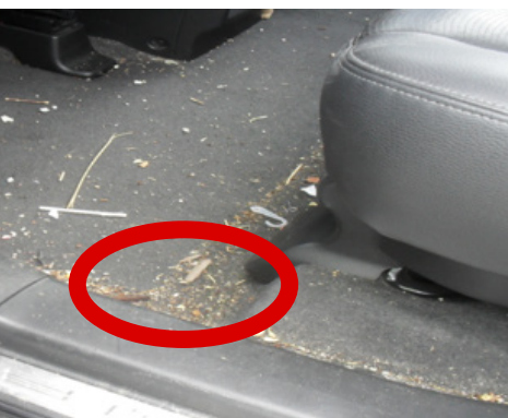
Vacuum under and between car seats. Lift rear car seats unless bolted.