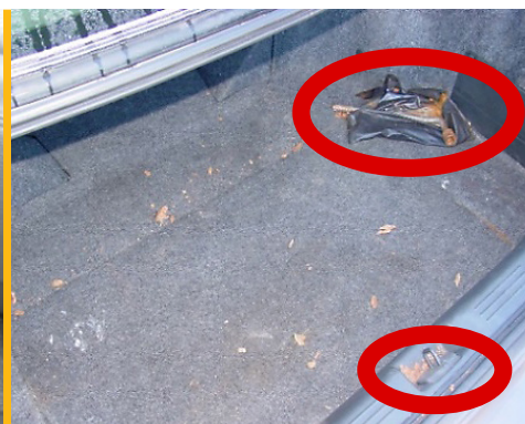
Vacuum the boot/trunk to remove any contamination.