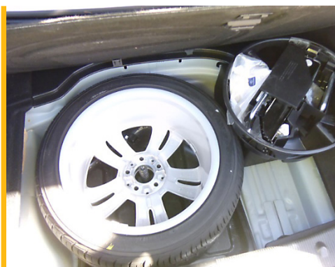
Look for egg masses and insects on spare tyre. Vacuum tyre tray.

Clean interior areas of a vehicle including the boot/trunk, between and under car seats, ceiling areas, floor surfaces, side panels, all compartments, the spare tyre and storage area.